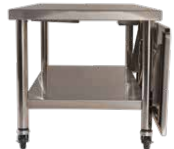
Upper tier shown in storage position